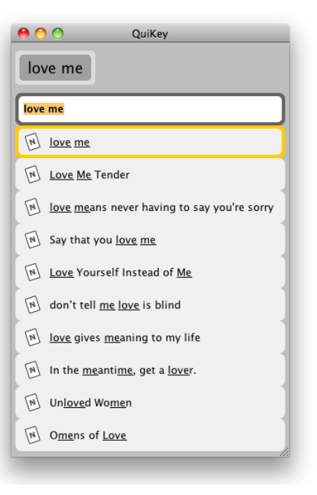
Fig. 1. Text Search: A number of items is shown that match the search string "love me".

QuiKey is organized around the notion of parts . A part can be an existing item, a relation, a new text string or a command. Depending on the types and order of the parts entered, it is decided what action to take. The following are the main functionalities of QuiKey. As explained below, they are tightly interwoven.