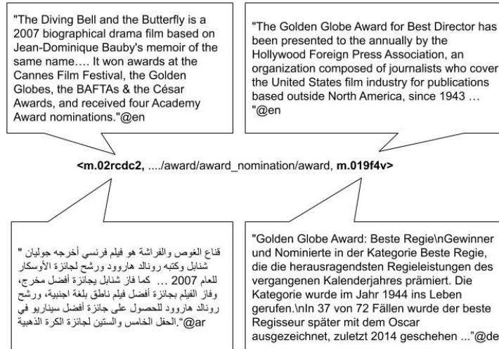
Fig. 1: A triple in FB15K with multilingual descriptions of the head and tail entities from Freebase.

In most of the popular KGs, a single entity can have descriptions in two or more languages where the contents of the descriptions are different. This fact is demonstrated in Figure 1 using, as an example, a triple from FB15K with some of the descriptions of its head and tail entities extracted from Freebase. In this example, it can be seen that, for both the head ('m.02rcdc2') and tail ('m.019f4v') entities, the description provided in one language contains information that is not available in the description given in the other language. Hence, a KGE model which uses entity descriptions only in one language discards the extra information provided in the descriptions in other languages.