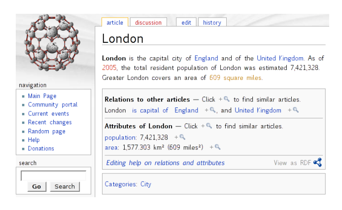
Figure 2: A semantic view of London.

in Figure 2 looks as in Figure 3. In Wikipedia, links to other articles are created by simply enclosing the article names in double brackets. Classification in categories is achieved in a similar fashion by providing a link to the category. However, category links are always displayed in a special format at the bottom of an article, without regard to the placement of the link inside the text.