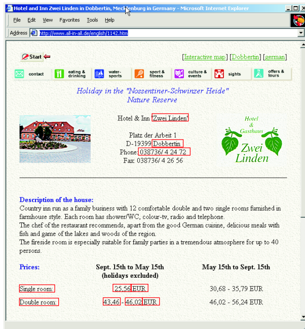
Fig. 1. Annotation example